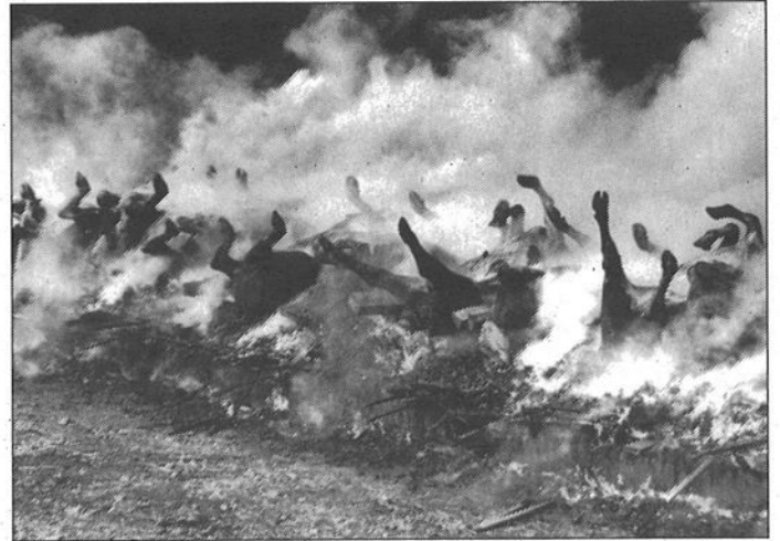
Incineration of diseased cows in England.